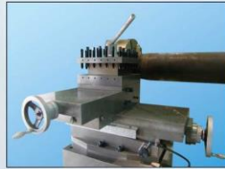
▲ Cross and Longitudinal Compound Rest. (X1 and Z1 travel capability) 十字行程的複式刀座 (可作X1及Z1軸方向移動)