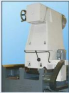
▲ Motorized Tailstock at the rear 2 guide-ways 電馬驅動尾座，在後方兩導軌上