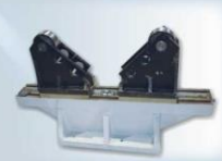
▲ Heavy Duty Steady Rest (opt.) 滾輪座 (選配)