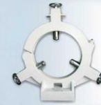
▼ Steady Rest (opt., only for Full length cross-slide) 中心架 (僅能選配給全長床鞍)