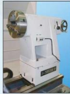
▲ Tailstock Rotary Quill, A2-11 nose, MT#7 taper (3-jaw or 4-jaw chuck is in opt) 尾座迴轉心軸 (可選配安裝3爪或4爪夾頭)