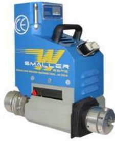
W Smaller from \varnothing 22 mm to \varnothing 70 mm

IN LINE BORING ALSO IN BLIND HOLES FROM \varnothing 22 MM TO MORE THAN \varnothing 70 MM INTERNAL WELDING ALSO IN BLIND HOLES FROM \varnothing 25 MM TO MORE THAN \varnothing 400 MM EXTERNAL WELDING FROM \varnothing 20 MM TO MORE THAN \varnothing 250 MM