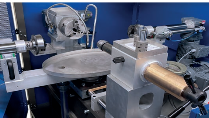
| View inside the ROTAGO