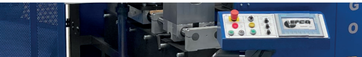
| Safe operation via the ergonomic control panel