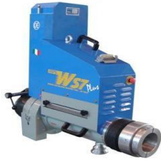
WS7 Plus from \varnothing 400 mm to \varnothing 1700 mm